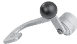
Roller Mounting Help Tool (EAA0304G48A)