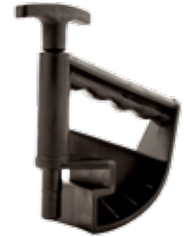
Bead Holding Clamp (EAA0247G70A)