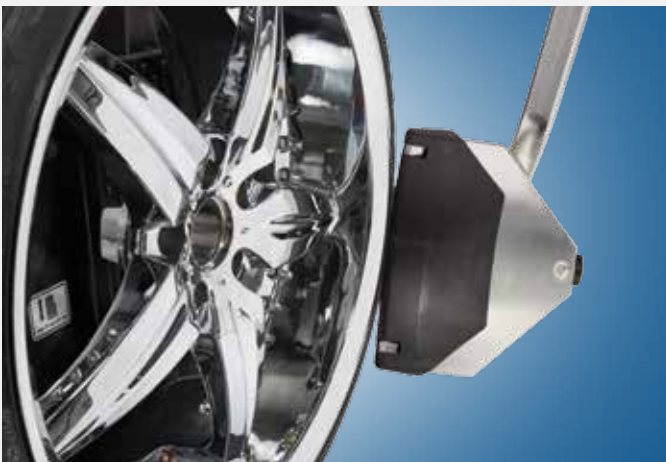
Hand Activated Bead Breaker