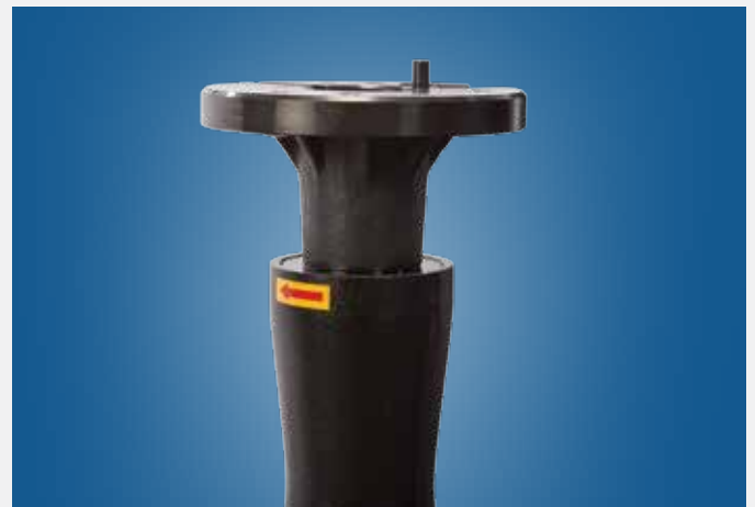
Center Post Clamp Design