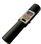
Radio test lamp